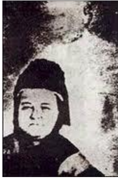
Mary Todd Lincoln (pictured above)

The most frequently reported sighting in the White House is that of Abraham Lincoln, our 16 th president; whose life was cut short by an assassin's bullet in April 1865. Psychics have speculated that Lincoln's spirit remains in the White House for two reasons; first, to be on hand in times of crisis and second to complete the difficult work that his untimely death has left unfinished. It has also been reported that First Lady Mary Todd Lincoln would hold séances in the White House to try make contact with her son. The Lincoln's 11 year-old son, Willie, died in the White House of Typhoid.